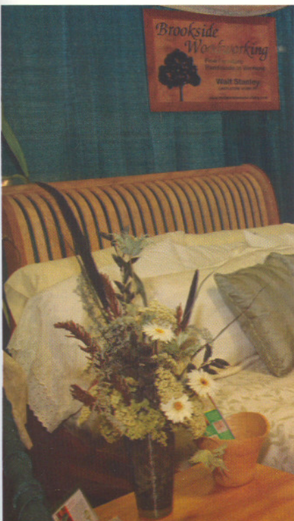
Bed by Walt Stanley, Brookside Manu.