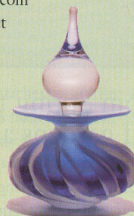
RIB TWIST BOTTLE, ARTISANS HAND

Wooden Horse Arts Guild , North Troy, www.woodenhorsearts.com