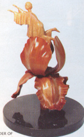
IRIS MOVING ON-RICK SCHNEIDER OF VERMONT CUSTOM WOODWORKING